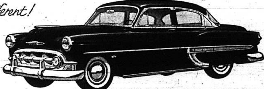
An entirely new kind of Chevrolet in an entirely new field all its own