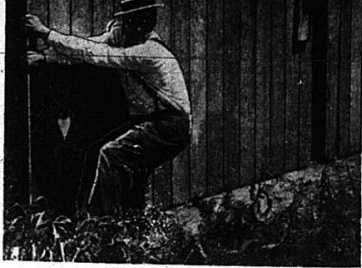
One of the few instances when it's not Buster's own sack that's sitting out in this scene from the film "Paradise for Buster", feature picture of the coming John Deere Day program.

Buster Keaton, long famed as a comedian of stage and screen, stars in "Paradise for Buster", the feature film that highlights the John Deere Day program to be given for farmers and their families 27, Jan., by Mt. Vernon Hardware, local John Deere dealer. The program which is free, includes a complete list of entertaining and educational pictures in the store and is scheduled to begin at 10 o'clock.