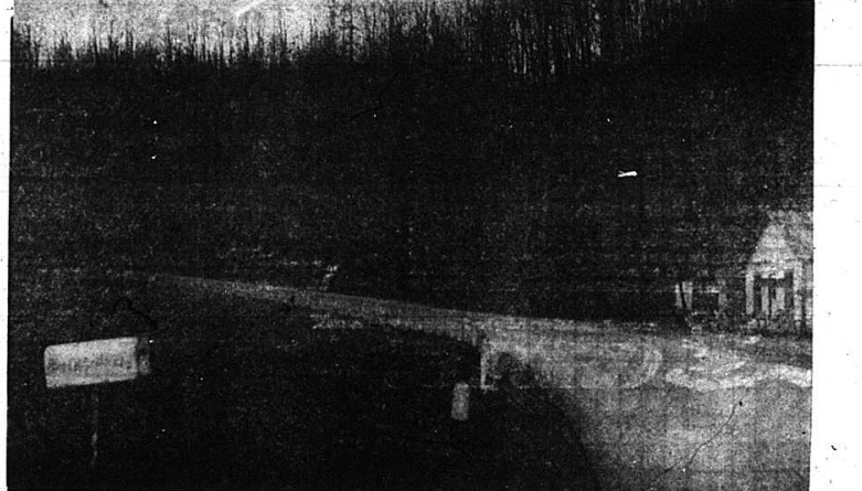
The north side of Boone Gap where the new U. S. 25 will cut a wide swath to the left, nearer the L. & N. tracks. Underbrush has already been cleared away for the new road. Dirt from top of the Gap will be used to fill in the deep ditch on the left and swing in an easy curve to the top of the Gap.