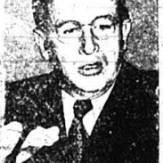
SETS FARM POLICY... Agricultural Secretary Ira Tull Benson says he favors farm price supports, and states there will be no immediate sweeping changes in farm programs.