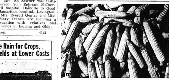
Corn bins are fuller and profits higher when crop gets plenty of well balanced fertilizer.