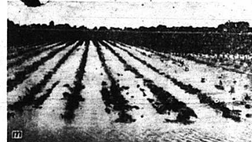
Water that ponds or runs off is the same as water lost.

FIVE steps to save more rain for farm crop use were cited by the Middle West Soil Improvement Committee, in a statement issued here. The committee points out that efficient water use is becoming more important to farm profits in view of the drought conditions by weather forecasters that the Corn Belt may be in for a long range dry cycle. Here are the committee's suggestions: 1—Protect the soil surface with cover crops. That will prevent beating rains from sealing over the surface. Water will soak in instead of running off. 2—Keep the soil well structured with well-fertilized tap roots that will let in more water. 3—Keep the soil fertile with chemical nutrients. This will help you produce more pounds of crop per acre inch of water. 4—Keep the soil rough during winter. That will hold snow in place and enable water to soak in during spring thaws. 5—Handle organic matter so it will give the greatest good to the soil. Rot it quickly by providing nitrogen, phosphate and other plant nutrients to increase the soil's population of beneficial organisms. "All these practices," says the committee, "will increase the amount of water available to crops on your fields. They will provide more water for greater yields at a lower cost that will let in more water per acre."