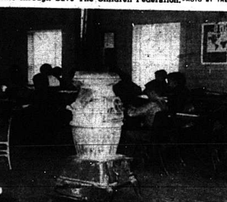
A collection of National Geographic magazines was bought for the school. Last year the following equipment was purchased: A wall atlas of fifteen maps, a globe, and a set of twenty-five copies of the year's large Webster Dictionary-in amount given by the sponsor. A "spending pencil" sharpener, a pan blectograph, and art materials were added. A special gift by the sponsor for venetian blinds has been quite an improvement.