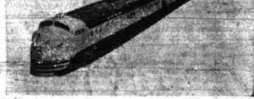
A miniature train for the kiddies to ride. There will be other rides and amusements too, plus a bicycle and adult watch as attendance prizes. Valuable prizes for the adults also.

Consistent crowd-pleasers in the annual event are the four contests for standouts in beauty, driving, valuable prizes are offered and local winners will