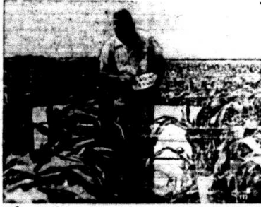
Fall-fertilized corn (right) makes as vigorous growth as spring-fertilized plants (left), in Minnesota tests.

PUTTING ON this fall the fertilizer you would normally plow down or disc in for corn or small grains next spring, can give you a bonus now. The Joint West Soil Improvement Committee points out in a recent statement. Adding fertilizer this fall has these advantages: -It leaves you more time for work next spring. Fields and roads are firmer in the fall and the work is easier to get on with machinery. -The fall-added fertilizer will be there in spring with little loss of nutrients on most soils. -You will get just as good yields of corn and spring seeded grains from fall applied fertilizer as from the same amount of nitrogen, phosphate and potash broadcast and plowed under in the spring. Tests in Minnesota and other Midwestern states indicate that fall fertilization gives as favorable crop results as does spring-added fertilizer. Agronomists estimate that in the fall you are more likely to find the exact grade and amount of fertilizer you need for next year's use. It is important to act promptly, however, in making arrangements for your fall fertilizer supplies, so they will be on hand when you want them. Agronomists cite these precautions for the use of fertilizer in the fall: -Nitrogen fertilizers should not be applied until the soil cools down to 60 degrees or below. Nitrogen and to some extent potash should not be put on sandy soils where there is the probability of leaching through excessive internal drainage. Fertilizers should not be applied to frozen ground.