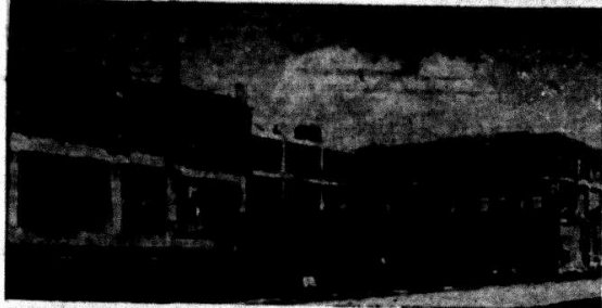
WORK PROGRESS ON NEW... THE $11,000 dormitory has been started to house 80 students... Work is expected to be completed January, 1955.