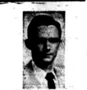
By Alfred Sparks, Jr.

"Put some LIFE into it" The following analogy may strike you as being funny, but when you stop to think of it, in one respect life is like cooking - the finished product can only be as good as the elements that make it up. A good cake is compounded of pure ingredients, and the same is true of a good life - because your life represents exactly what you have put into it.