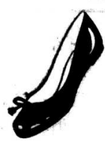
Two Flats in Smooth Harmony

Autumn fashion note... smooth harmony done in two flats. They're slender little shells, rimmed about with grograin and bottled for perkiness at your toes. For hills steps on campus, in town at home - nothing could be finer. Pick your own in leather red as it pleases or rich black leather. Only $2.98