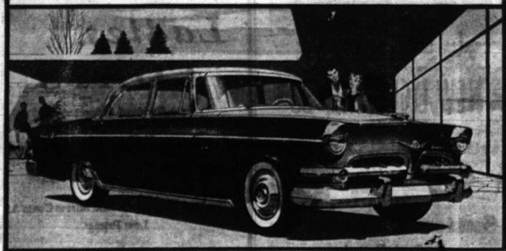
New Dodge Custom Royal 4-Door Sedan—Proud-Powered for the Future.