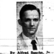
By Alfred Sparks