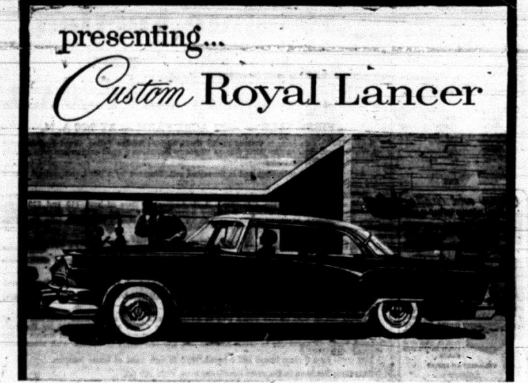
Custom Royal Lancer V-8 in dramatic new three-tone exterior styling.

OPTOMETRIST ANNOUNCES The Opening of His Offices At 103 S. Main St. Somerset, Ky. Phone 118 For Appointment