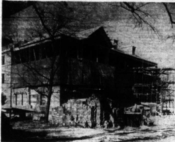
Brick work on the exterior of a new $723,857 wing of the Berea College Hospital near completion and interior electrical and tiling work will begin immediately. Dan Tuttle, hospital business manager, reported this week. The R. D. Short Construction Company of Lexington, holder of the building contract, said that the new structure will be completed in about a year. The third floor of the new structure will house the obstetrical division and nurseries. The second floor will contain operating rooms and the basement will have a dining room, central oxygen room, general storage rooms and a housekeeper's office. The present hospital was built in 1918. Overcrowdedness since World War II made the new construction necessary. The hospital facilities will be replaced to better advantage. The Berea hospital serves a large area in Madison, Jefferson, Rockcastle and Garrard counties.