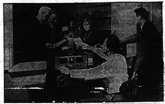
AMATEURS AND PROFESSIONALS on the staff of the Federal Civil Defense Administration provide a variety of voices for one of the ships in a series of "upper atmosphere" broadcasts.