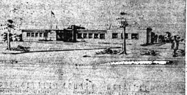
Architect's sketch of Rockcastle County Hospital, to be built on Newcomb Avenue in Mt. Vernon.