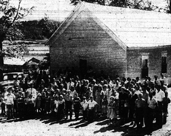
The crowd above saw three new Sunday School rooms dedicated Sunday at the Clear Creek Baptist Church. The Sunday School rooms were built to help accommodate the church's 126 new members.