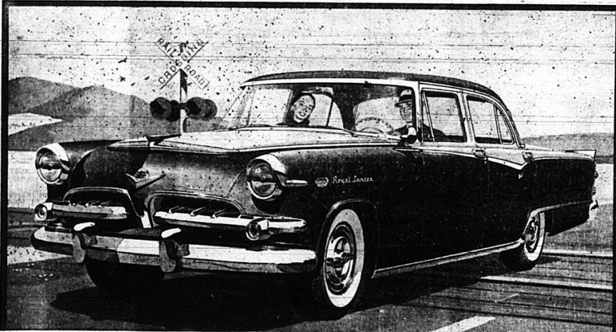
New Dodge Custom Royal Lancer 4-Door Sedan—the flair of a Hardtop, the roominess of a Sedan.