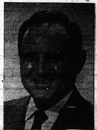
HARRY LEE WATERFIELD FOR LT. GOVERNOR