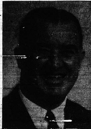
A. B. "Happy" CHANDLER FOR GOVERNOR