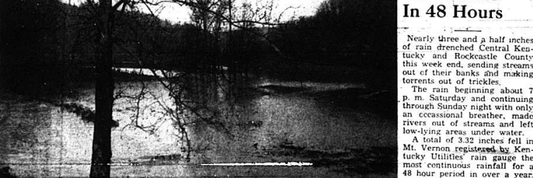
Nearly three and a half inches of rain drenched Central Kentucky and Rockcastle County this week end, sending streams out of their banks and making torrents out of trickles.

The rain beginning about 7 p. m. Saturday and continuing through Sunday night with an occasional breather, made rivers out of streams and left low-lying areas under water.