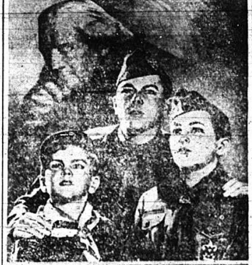
Onward... For God and My Country 46th ANNIVERSARY 1956 BOY SCOUTS OF AMERICA

More than 4,100,000 Cub Scouts, on today's world and to prepare Boy Scouts, Explorers and adult leaders throughout the nation in the years ahead will observe Boy Scout Week. Boy Scout Week observances February 6 to 12, marking the 46th anniversary of the Boy Scouts of America, will be conducted by each of the nation's 104,000 units at 3,000 different places on February 24, 500,000 boys and adult leaders, the actual birthday of the organization. The new Four Year Program of the Boy Scouts of America, which is launched in 1956 to help boys of America and its rich program America's boys to become leaders.