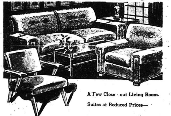
A Few Close-out Living Room Suites at Reduced Prices

Oxygen-Equipped Ambulance Service ANYTIME - ANYWHERE Phone 39 Mt. Vernon, Ky. Member Kentucky Funeral Directors' Burial Association