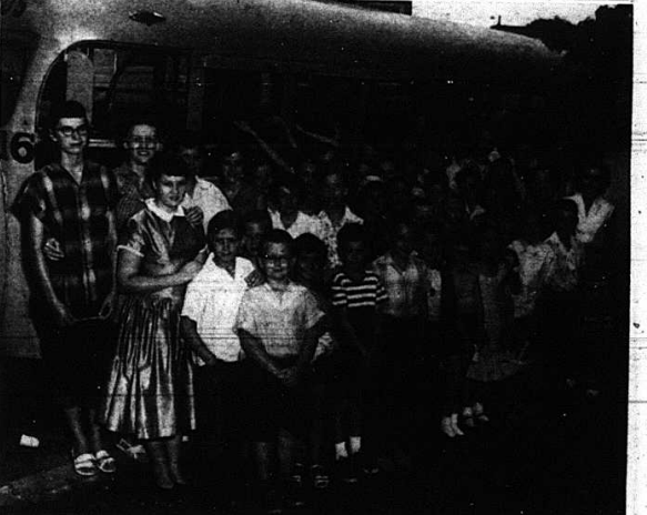
SWIMMERS GALORE—Swimmers from all parts of the county this past week completed two weeks of instructions in how to swim at the Somerset pool. The swimming lessons were sponsored by the Meridian Woman's Club at Mt. Vernon. The students were taken daily to