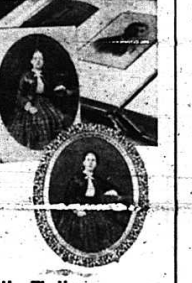
Like Finding Hidden Treasures