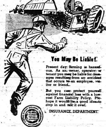
The Bank of Mt. Vernon