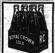
Take Home A Carton TODAY