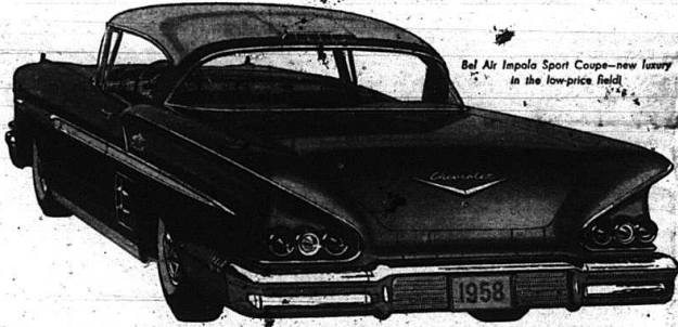
Bel Air Impala Sport Coupe—new luxury in the low-price field.