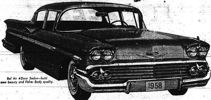
Bel Air 4-Door Sedan—bold new beauty and Fisher Body quality.

Only franchised Chevrolet dealers display this famous trademark. See Your Local Authorized Chevrolet Dealer