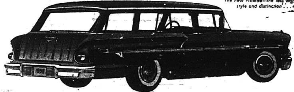
The new Nomad—the last word in station wagon style and distinction... 4-door, 6-passenger.

Sales and Service Phone 331 & 589 Berea, Ky.