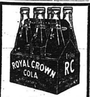
Take Home A Carton TODAY

Merry, be merry and be of good cheer. Shopping for Christmas is easy this year. Now at your jeweler's, waiting for you are diamonds and silver and Bulova watches too. Bailey's Jewelry Store, Mt. Vernon, Ky.