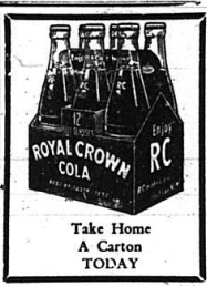
Take Home A Carton TODAY