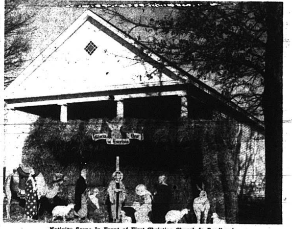
Nativity Scene In Front of First Christian Church in Brodhead