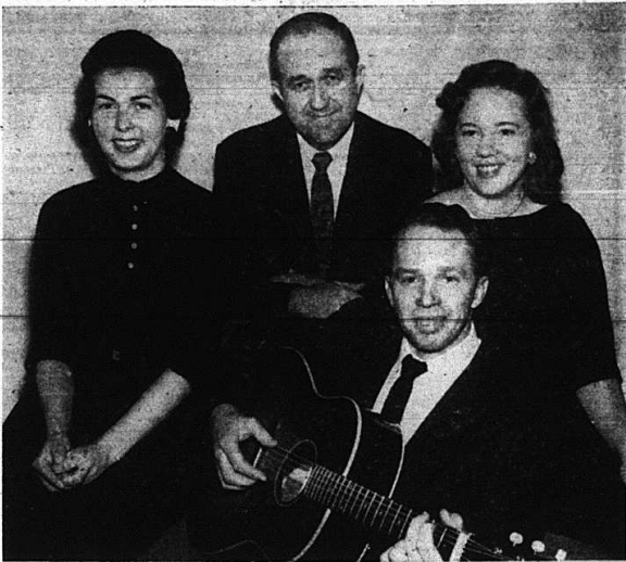
ALL NIGHT SINGING CONVENTION - The Madison County Singing Convention will sponsor an all night sing at the Ottawa Baptist Church, in Rockcastle County at 7 p. m., Saturday, March 29. The public is invited and a special invitation is extended to all singers.