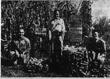
Crib-busting yield (right) comes when corn crop gets heavy pre-planting application of fertilizer, plus starter and plenty of additional nitrogen.