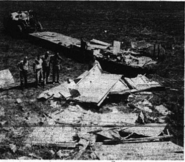
NOT A FLAT-CAR, but what was left after the 40-foot house trailer wrecked about five miles north of Mt. Vernon Wednesday. The two men who were riding the pickup truck that pulled the trailer, have been released from the Rockcastle County Baptist Hospital.

Two brothers were injured, five miles north of here on U. S. 25, and plunged down a 30-day when a pickup truck and foot embankment. The trailer 40-foot house trailer they were destroyed. Injured were: riding left the highway about