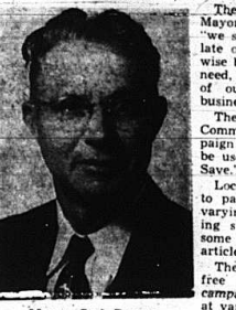
Mayor Carl Brown

Merchants and businessmen all over town have joined in an attempt to stimulate slow business through price-reductions and special offers for the campaign.