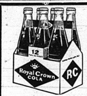
Take Home A Carton TODAY