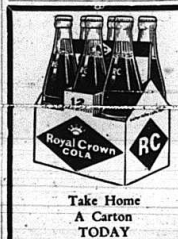
Take Home A Carton TODAY

Only land owners in the Buck Creek Watershed can vote in this referendum. Farmers in the Brushy Creek, Durman Creek, Bee Lick Creek and Bull Pen Branch section may vote.