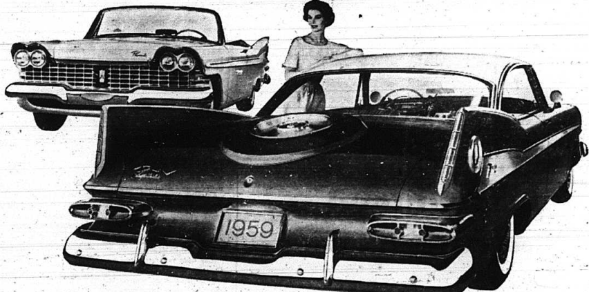
NEW SPORT DECK standard on SPORT FURY models shown above... available at slight extra cost in every Plymouth price range.

ANNOUNCING THE '59 PLYMOUTH that brings you new beauty...new features...and new FURY models at a new low price!