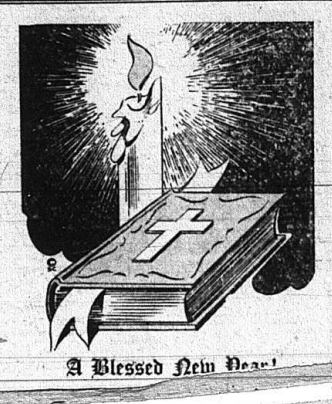
A Blessed New Year!

The newspaper is convenient; it may be consulted at a time most convenient to every member of the family. Newspaper advertising occupies top position in the minds of successful retailers because it is so important.