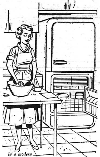
in a modern Combination Electric REFRIGERATOR-FREEZER

Two wonderful electric appliances in one compact unit! This combination electric refrigerator-freezer is designed for kitchen convenience... keeps fresh and frozen foods near your work center to save you time, steps and effort.