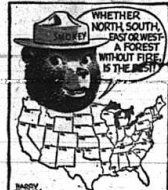
Forest fires know no boundaries!