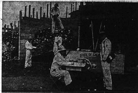
RADIOLOGICAL MONITORS of the San Diego City-County Civil Defense organization go through their paces by checking on "false radiances" at a training site designed specifically for civil defense use. After taking their readings, the men in background would radio their reports to a central plotting and coordinating crew such as the two planning the radiological trailer in foreground. The nation's radiological monitoring capability is being expanded rapidly by civil defense at all levels, including more than 11,000 monitoring stations now operating.