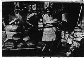
Outdoor bake ovens which dot the picturesque countryside throughout the Gaspé Peninsula of Quebec — "The Normandy of North America" — are never failing attractions for American visitors. — PMS