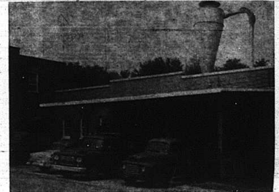
MT. VERNON PRODUCE

IN MERCHANDISE OR SERVICES GOES TO EACH PERSON WHOSE NAME APPEARS IN THIS ADVERTISEMENT...SIMPLY BRING COPY OF "BUY IN MT. VERNON & ROCKCASTLE CO." PAGE BEARING YOUR NAME TO THE MERCHANT WHOSE AD YOUR NAME IS ASSOCIATED WITH IN THIS ISSUE...BE SURE TO SUBMIT PAGE CONTAINING YOUR NAME BETWEEN MONDAY AND THURSDAY FOLLOWING PUBLICATION DATE OF THIS NEWSPAPER...DO NOT APPEAR WITH PAGE LATER THAN STORE CLOSING TIME ON THURSDAY THE WEEK FOLLOWING DATE OF THIS ADVERTISEMENT...TO DO SO WILL RESULT IN FORFEIT OF YOUR $5.00 AWARD...WINNERS $5.00 AWARD INCLUDES ANYTHING STORE OWNER HAS IMMEDIATELY FOR SALE...NAMES APPEARING HERE-IN WERE TAKEN PURELY BY CHANCE FROM CIRCULATION INDEX FILES OF THE MT. VERNON SIGNAL SUBSCRIBERS IN ROCKCASTLE COUNTY ONLY.