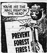
YOU'VE HIT THE NAIL RIGHT ON THE HEAD!