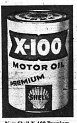
New Shell X-100 Premium.

Shell's research reveals five common internal troubles that can shorten the life of your car. All five work silently and unseen. These troubles are additive ash, crankcase dirt, temperature changes, engine acid and cooling system leaks. Read how new Shell X-100, Premium fights all five internal troubles.