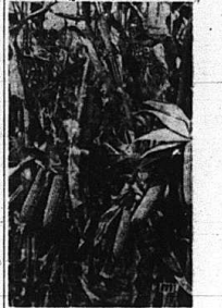
Well fertilized corn matures quicker, is ready to pick earlier in the fall.

to-phosphate-to-potash should be 1-4-0, 1-4-4 or 1-4-2. Starter fertilizer isn't the entire story, the National Plant Food Institute reports. The corn crop has to be fed all season long. Hence the soil