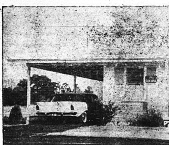
The OAK HILL

1949 Chevrolet Cab & Chassis Britton Chevrolet Co. 593 W. Chestnut St. Berea, Ky.