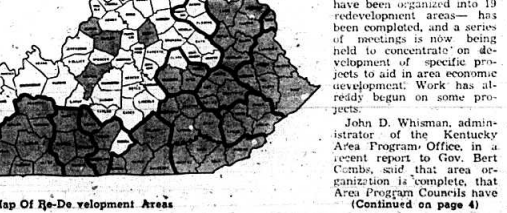
Map Of Re-Development Areas