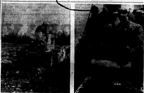
Tree seedlings and packing for shipping in bundles occupy workers at the Kentucky Division of Forestry near Gilbertsville. The seedlings are available to farmers in Rockcastle County.

Both the Burley Tobacco Co-operative Association and