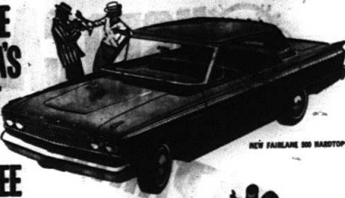
NEW FAIRLANE 88 HARDTOP