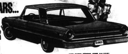
NEW SUPER TORQUE FORD GALAXIE

Presenting the most exciting choice ever offered—44 models in 4 sizes. Fun-loving convertibles, including a new Falcon Convertible! Midweight Ford Fairlanes, featuring hot 'n handsome new hardtops, wagons, sedans. Big 'n lively Ford