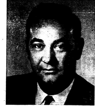
LOUIE B. NUNN

Unemployment is up. More people than ever are on the dole. The Combs-Breathitt machine hauls industrial scouts to Kentucky. Wines and dines them . . . but they shy away from what they see: Lack of planning, a house out-of-order, machine politics. No new industries means no new jobs. The dole gets bigger. Where are all the increased taxes going? The state payroll is over $2,000,000 a month more this year than last year. $2,000,000 a month to "oil" the Breathitt-Combs machine, not Kentucky's economy. The present administration clearly is interested in its own life span. Little else.