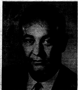
LOUIE B. NUNN

Remember, Judge Nunn has PROMISED sound fiscal management.