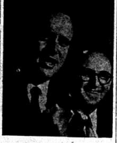
Rockcastle County Democratic Campaign Committee