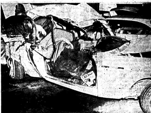
TWO PERSONS WERE KILLED and one injured critically when this late model auto breached a telephone pole in half and struck an apple tree.