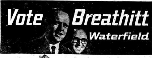
ROCKCASTLE COUNTY DEMOCRATIC CAMPAIGN COMMITTEE