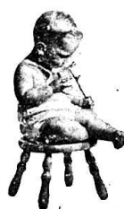
have your baby's portrait made in color