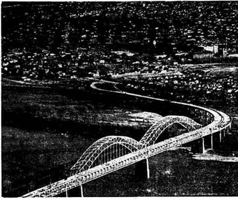
Kentucky's double deck Sherman Minton Bridge carrying Interstate Route 64 across the Ohio between Louisville and New Albany. It, won the American Institute of Steel Construction's award as the most beautiful long span bridge of 1962. Earlier winners of this high honor include the Golden Gate Bridge, the Mackinac Straits span and Rainbow Bridge over Niagara. On the Sherman Minton Bridge northbound traffic uses the upper level, southbound the lower.