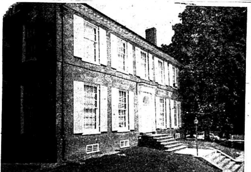
IN 1796, a young stone mason in his teens helped to lay the foundation for the governor's residence in Frankfort. Thirty years later, the same man, Thomas Metcalf, made his home there as Kentucky's ninth governor. Seven U. S. presidents and many other notables were guests at the old brick home between 1796 and 1914 when the new governor's residence and new Capitol were completed. In 1956, the original mansion was renovated as the home for Kentucky's lieutenant governor. Many of the original furnishings still grace the old residence, located on High Street.