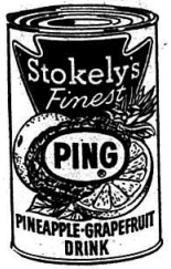
Ping Pineapple, grapefruit 3 for 89c