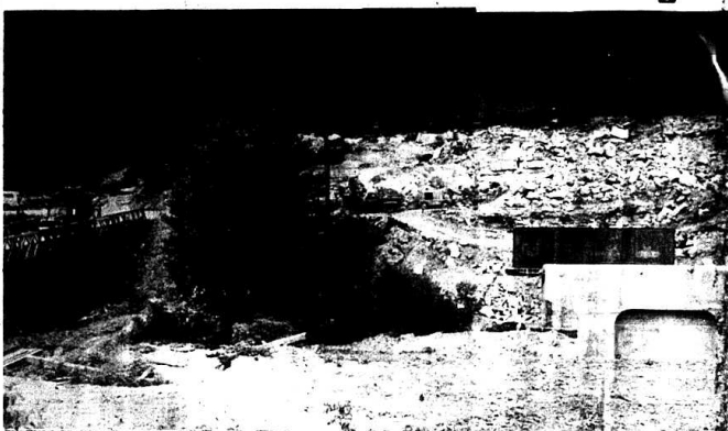
BRUSH CREEK BRIDGE TO BE - Construction is going along as scheduled on the bridge at Brush Creek. Piers can be seen at right and the old bridge at the left. The new concrete bridge will be 240 foot long and 10 foot higher than the old bridge.

Construction is going along as scheduled on the bridge being built across Roundstone Creek at Orlando. The Dixie Bridge Company of Lexington is doing the bridge building, with some of the grade work being done by O. P. Todd Construction Co., also of Lexington. The new concrete bridge will be 240 foot long and 10 foot higher than the old bridge. The new bridge is being financed with 50 percent of state money and 50 percent federal funds, at a total cost of $12,000,000. The by-pass is very difficult for residents living in the Cave area, but once the new bridge is finished it will be something for that section of the county to be proud of for years to come.