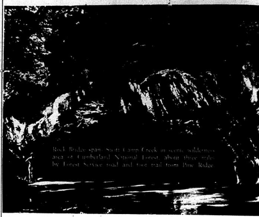
Rocky Ridge spans Scott Camp Creek in scenic wilderness area of Cumberland National Forest about three miles by Forest Service road and foot trail from Pine Ridge.