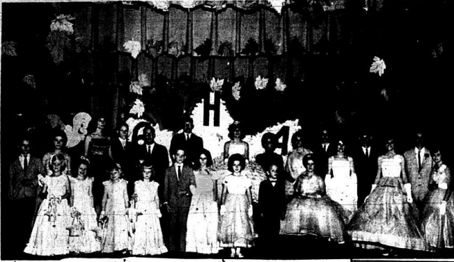
Broedbeck Halloween Carnival Royalty