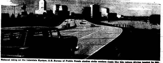
Reduced riding on the Interstate System. U.S. Bureau of Public Roads studies show modern roads like this reduce driving tension by 80%.