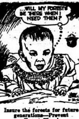
Insure the forests for future generations—Forest Forast Plan!