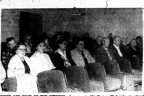
THESE ARE SOME OF THE PERSONS WHO CAME TO MI-VERNON WEDNESDAY TO ATTEND COURT IN THE NEW COURTHOUSE.