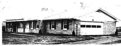
The Vaughn's new home is 1803 square feet and all electrically heated. Cost last year was only $145.10

"To me, its amazing cleanliness alone is worth the cost of electric heating."